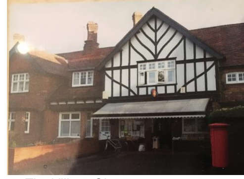
The Village Shop 2003

shop and Post Office. It was a fascinating talk and prompted a lot of discussion.