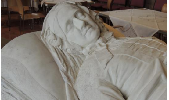
Lady Caroline has been cleaned and looks magnificent

We are delighted that we are now back in church. The final joinery and snagging work will be completed over the next few weeks. From Saturday 27 April, church will be open again every day between about 8am to 5pm, should you wish to pop in a have a look.